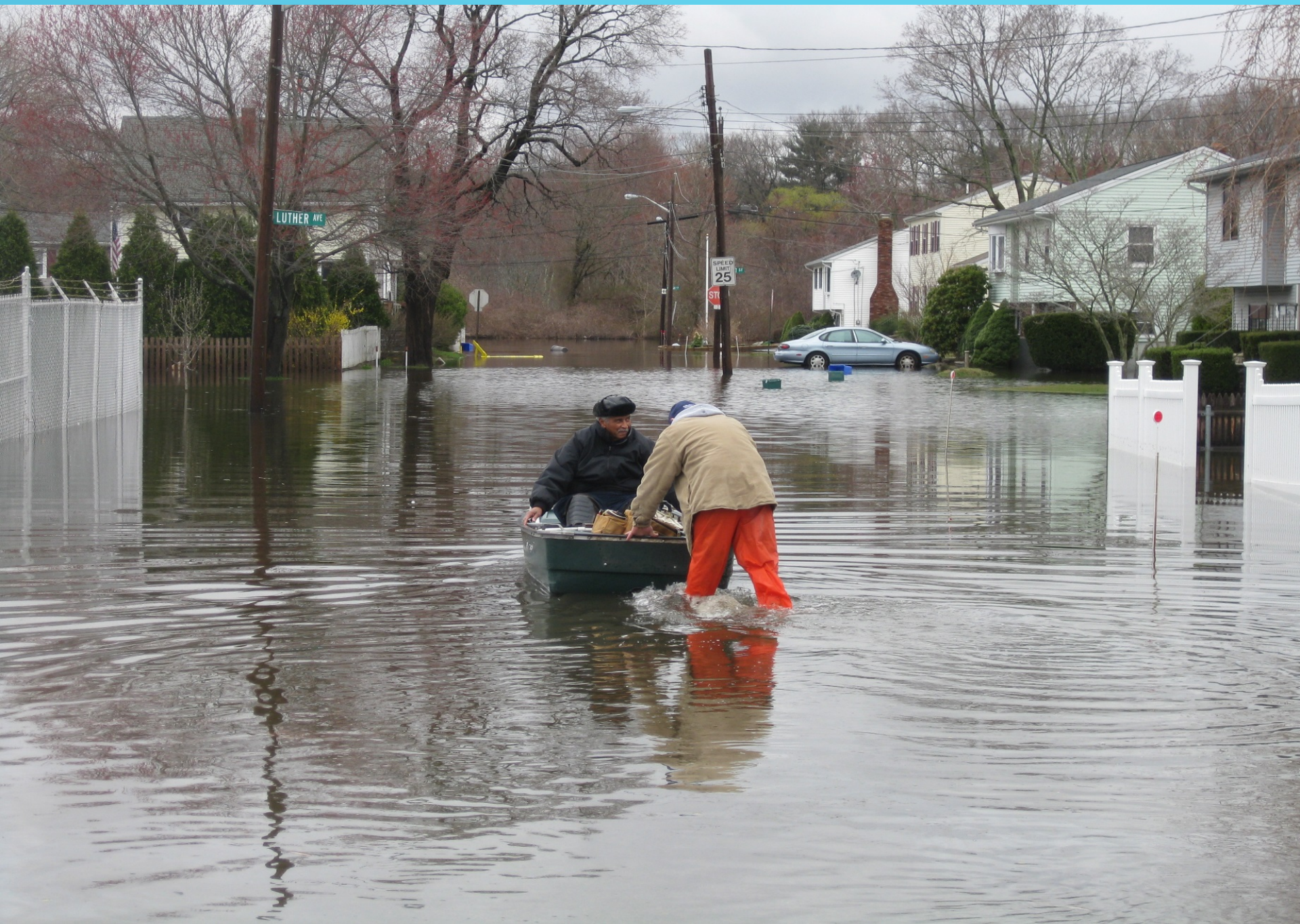
March 31, 2010 - State Street Neighborhood, East Providence